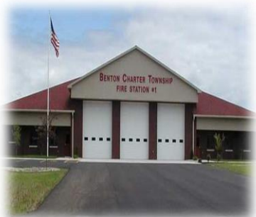
Benton Charter Township Berrien County Michigan